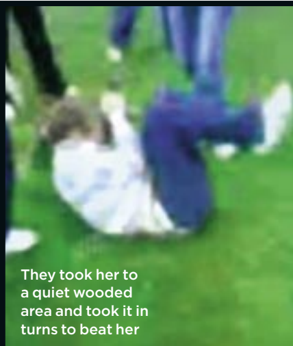
They took her to a quiet wooded area and took it in turns to beat her